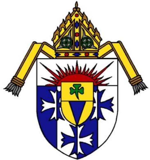
Diocese of Great Falls-Billings